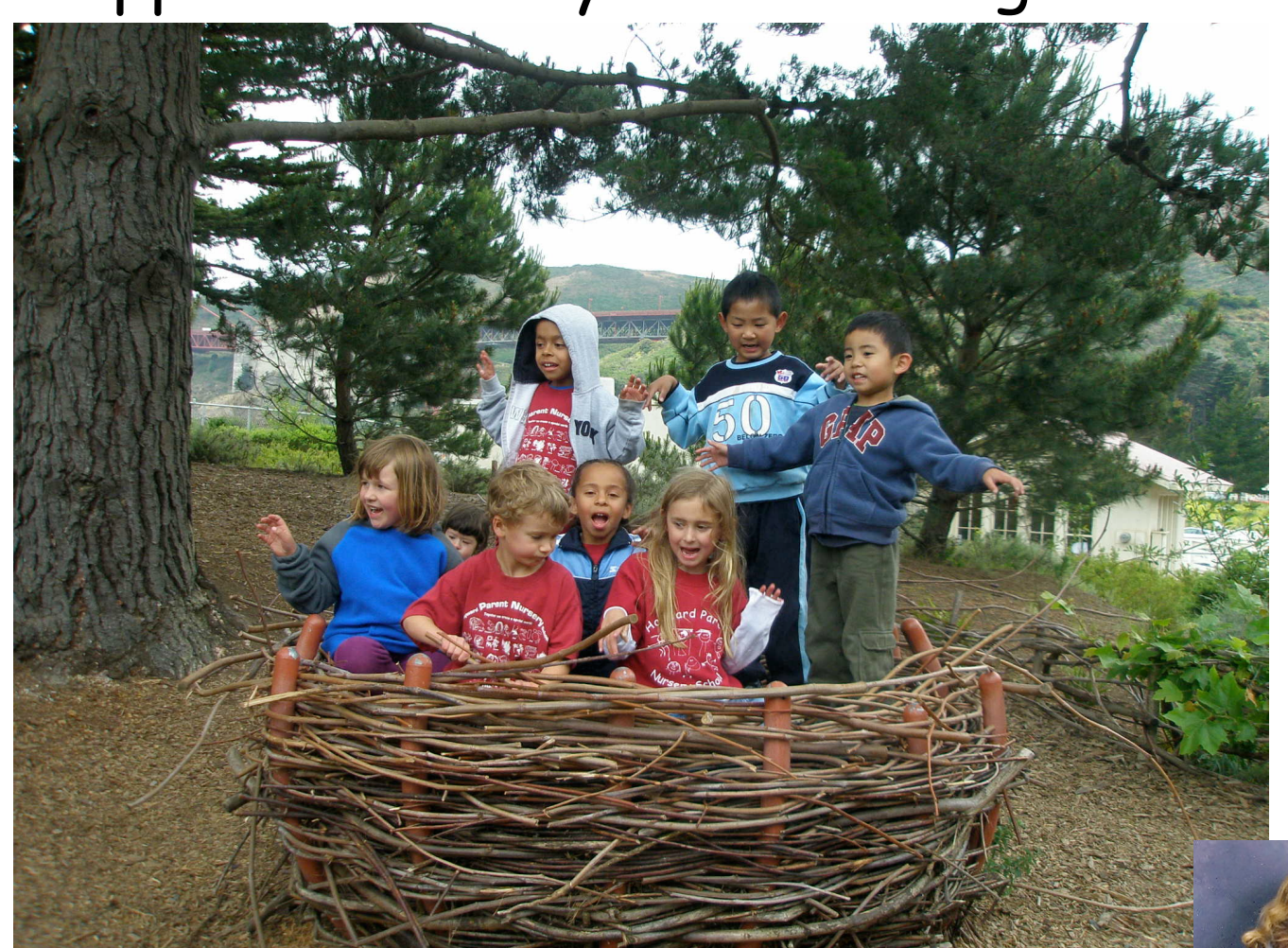
Land & Building Fund

We are reaching out to the community. Support HPNS by contributing to Our: